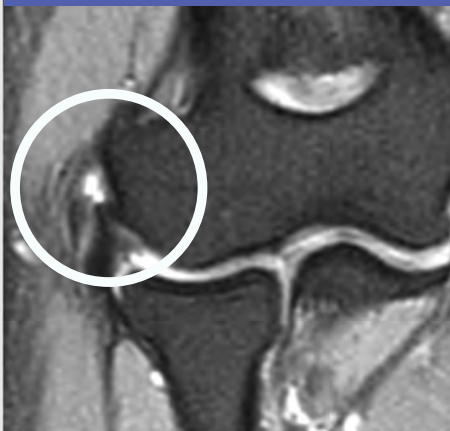
MONTH 1 INITIAL PRESENTATION

AMNIOFIX® TREATMENT: AmnioFix® Injectable (40 mg) (2) ultrasound guided injections month 8 and 11 RESULTS: 80% reduction of symptoms after 1 treatment; complete resolution after 2nd treatment